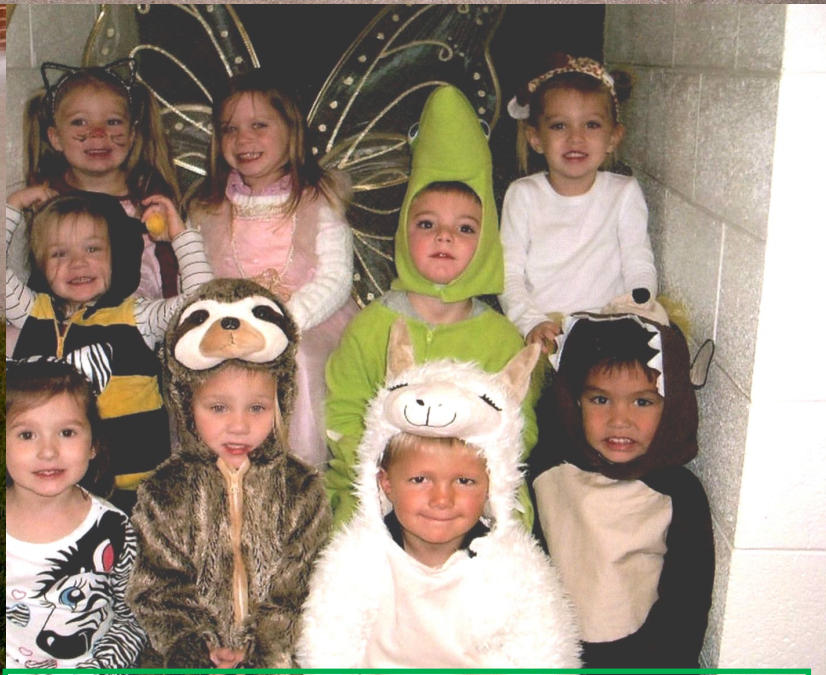
Noah's Ark Party