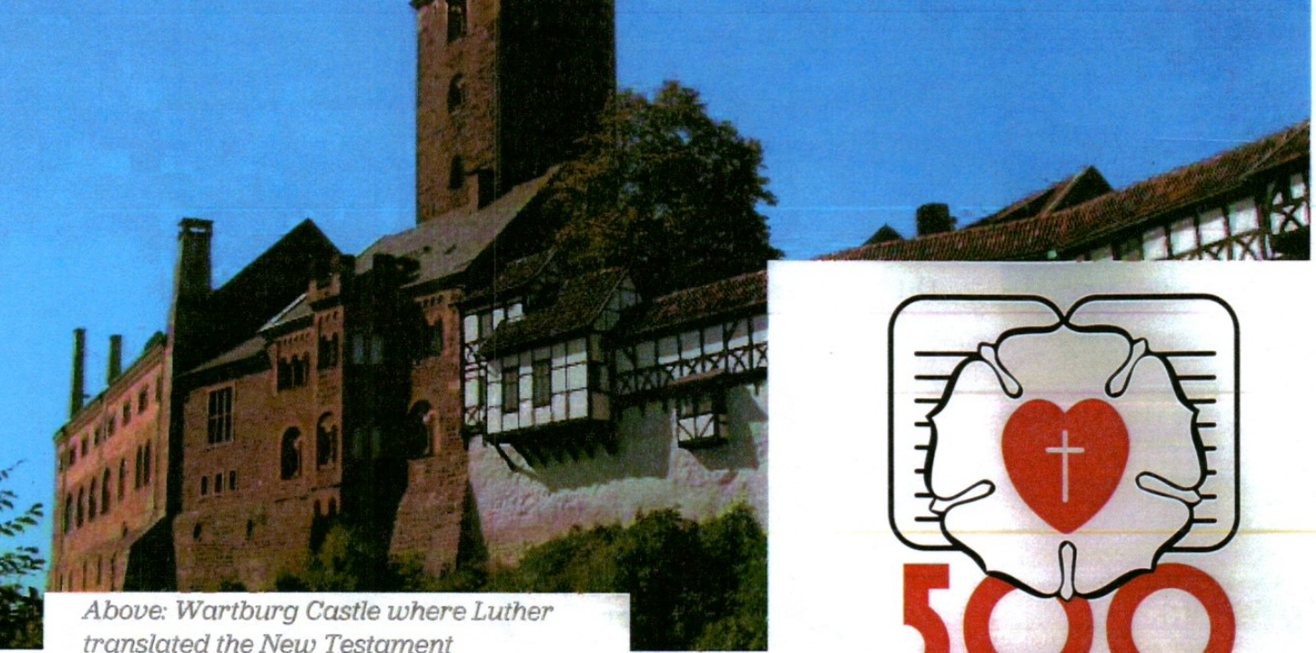
Above: Wartburg Castle where Luther translated the New Testament