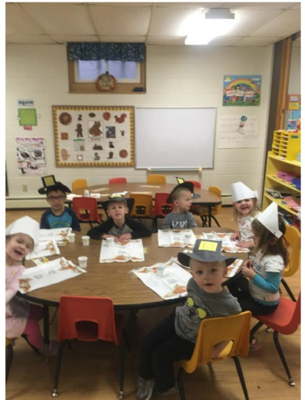
Our Little Pilgrims