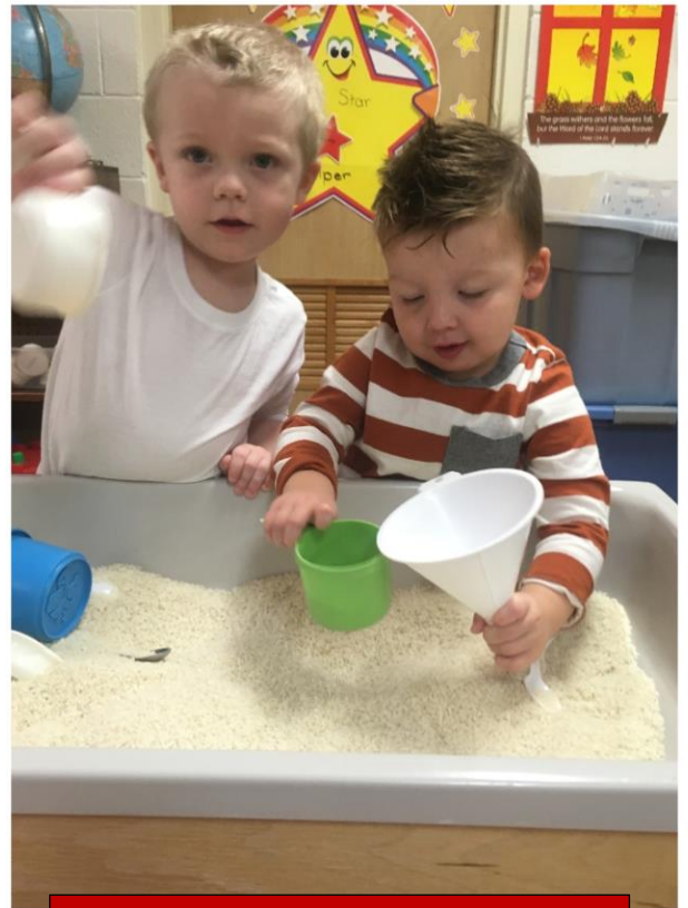
Friends playing at the rice table.

The Trinity Pre-school wish tree is in the narthex. If you would like to purchase a gift for the pre-school, please take a star off of the tree and purchase the gift that is on the star. Please wrap your gift and put it under the tree with the star attached. Thank you!