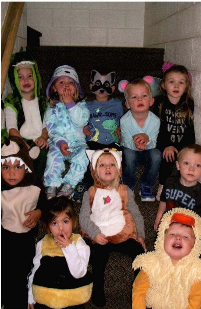
Noah's Ark Party