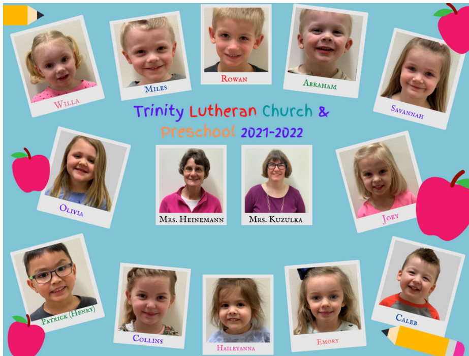
Preschool graduating class of 2022

Vacation Bible took place June 13-17th. We had 15 students. Our theme was "Monumental."